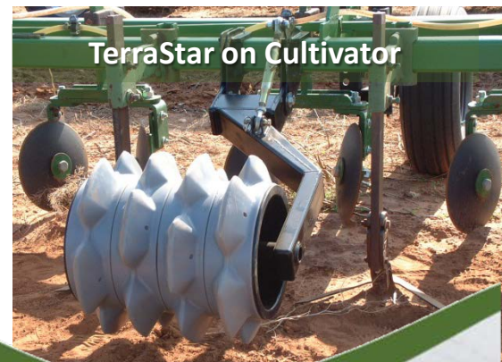
TerraStar on Cultivator

Ask your RJ Equipment, McDonnall Harvester or TerraManus Technologies representative for more details.